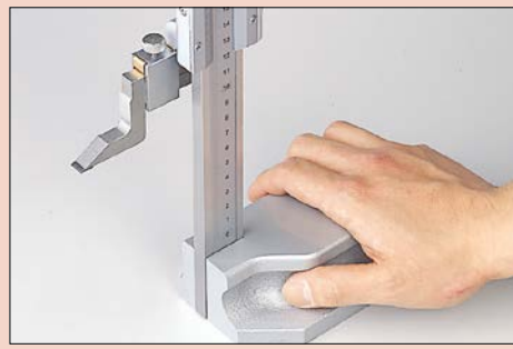
Base fits the hand comfortably.