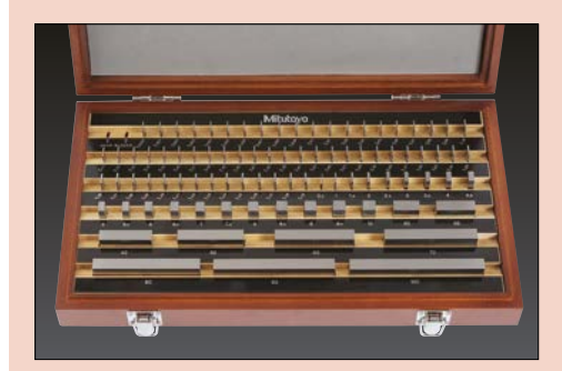
Steel 88-block set.