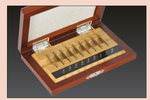
Steel 9-block set.