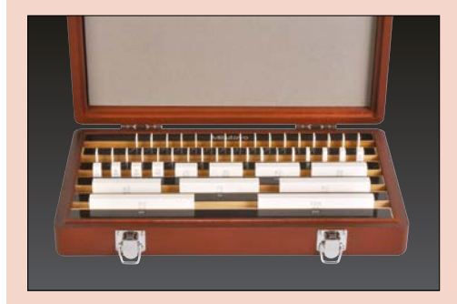
CERA 47-block set.