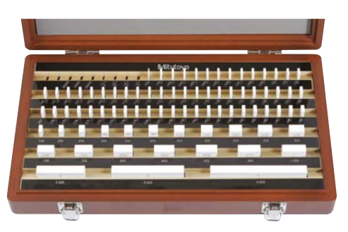
CERA 81-block set