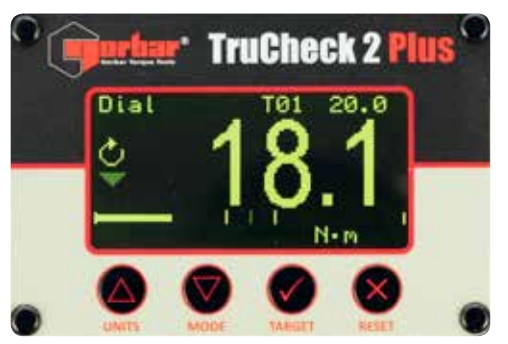
TruCheck™ 2 Plus display showing below target tolerance