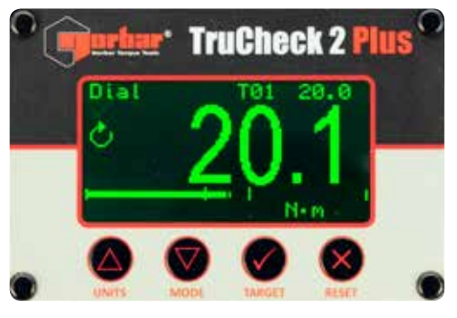
TruCheck™ 2 Plus display showing within target tolerance