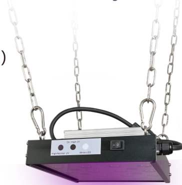
12 UV LED 4 White LED

UV - Panel series adopt the original Nichia UV LED as light source, no fan design, smart but rugged enough for industrial use.